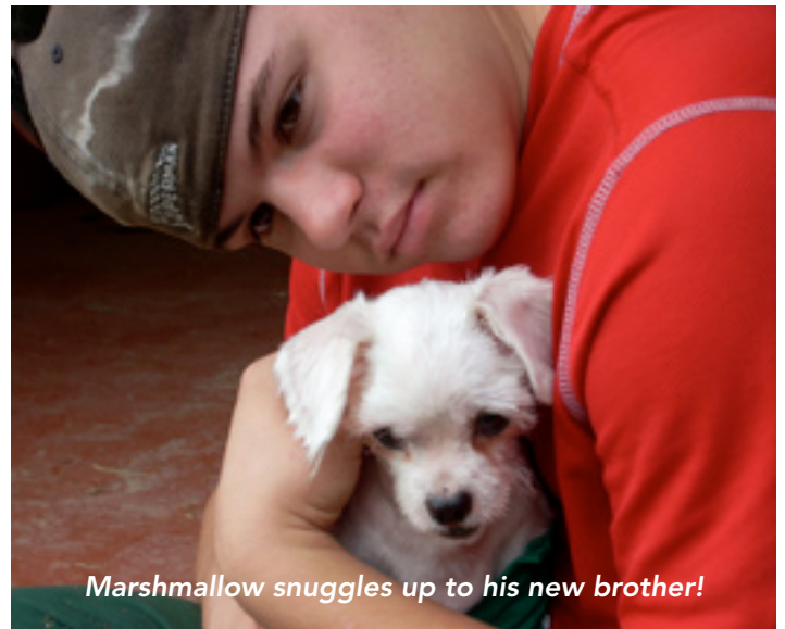
Marshmallow snuggles up to his new brother!

We thought we were saving him, but it turns out he was saving us all along. We thought he needed us, but it turns out that we're the ones that needed him.