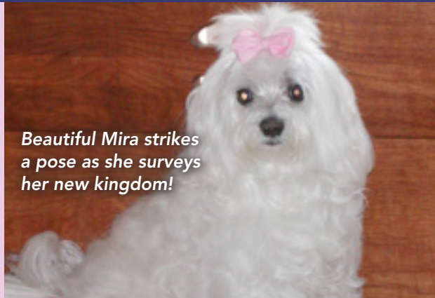
Beautiful Mira strikes a pose as she surveys her new kingdom!