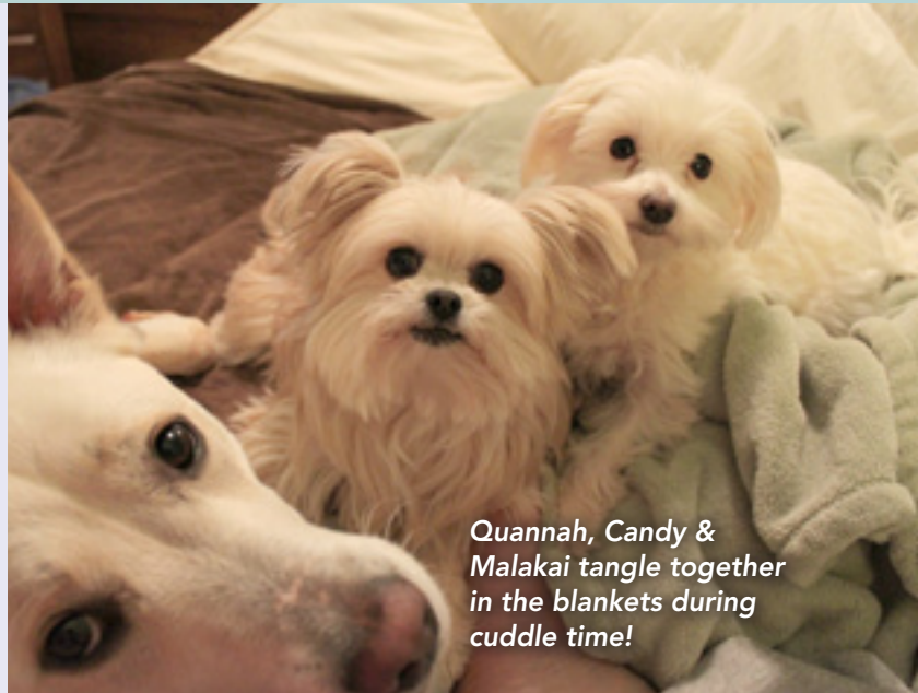
Quannah, Candy & Malakai tangle together in the blankets during cuddle time!