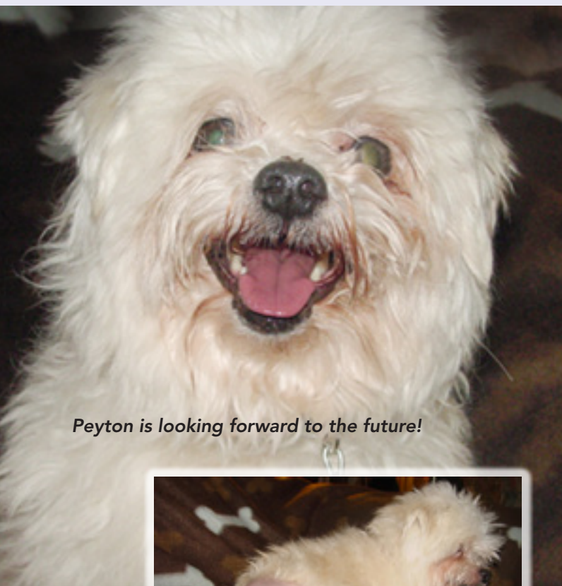
Peyton is looking forward to the future!